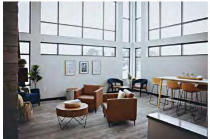
The waiting room at Dreier Family Dental in Janesville is designed to maximize natural light and save energy.

While many business owners consider green certification a plus, you can also be sustainable by doing some or all of the practices of a certified building in a non-certified building.